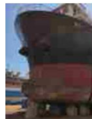
Marine Growth Removal